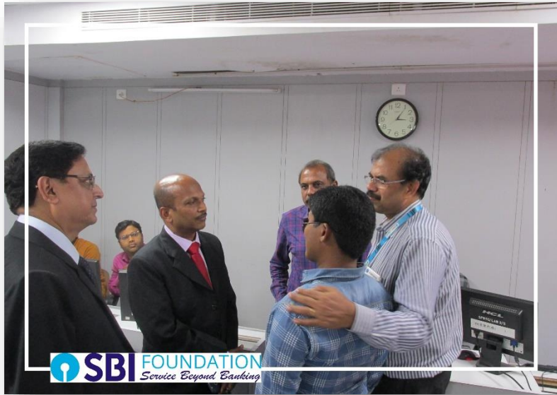
SBI Foundation Officials visited the Training Centre to meet the trainers and participants to know more about their experiences in the Training sessions.