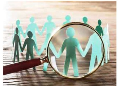
The 13-month fellowship, a flagship of the SBI Foundation, allows India's brightest young minds to work for the development of rural communities across the country in partnership with experienced NGOs.